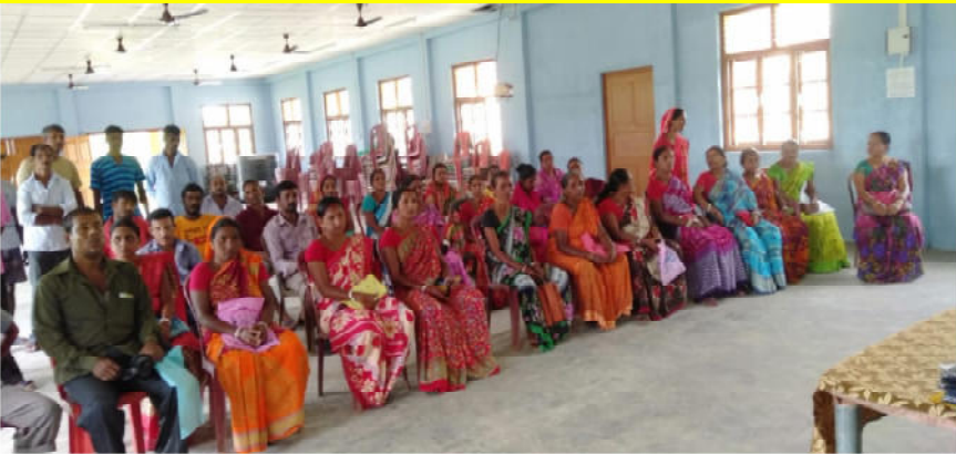
ANIBOCWWB conducts regular Awareness-cum-Spot Registration Camp on various welfare schemes